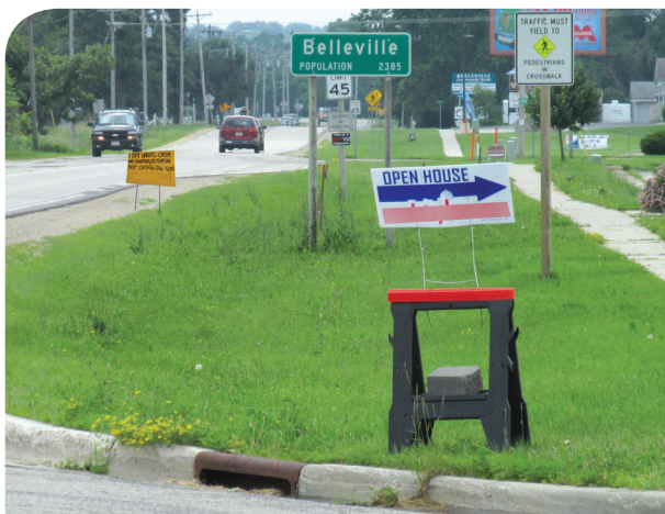
Signs placed improperly within the right-of-way may be a hazard.

For the safety of everyone, it is the duty of state and county workers to remove improperly placed signs. These workers are trained to handle such work activities safely.