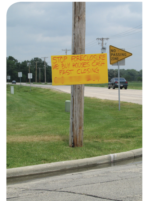
Signs may block motorists' vision, causing unsafe conditions.